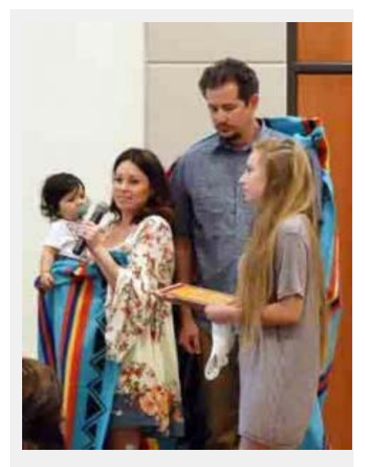
Tribal STAR Honored family