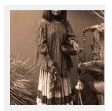
Sharlot Hall Museum Woman with water

The Calendar contains local events and conferences both local and national that will be of interest to those who work in or with the Tribal community.