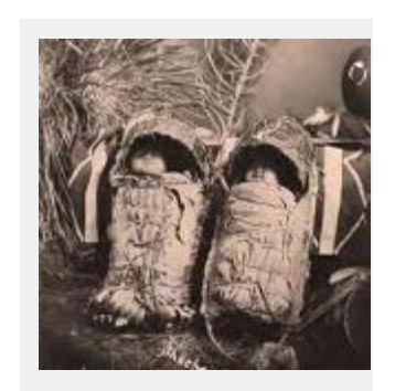
Sharlot Hall Museum Twins