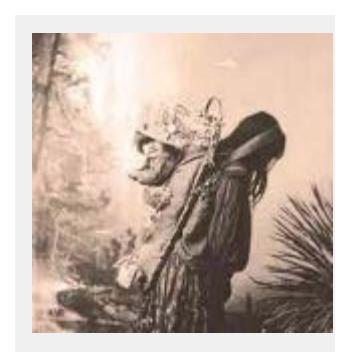
Sharlot Hall Museum Woman with papoose