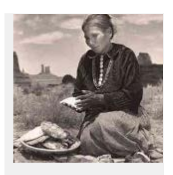
Sharlot Hall Museum Woman with basket