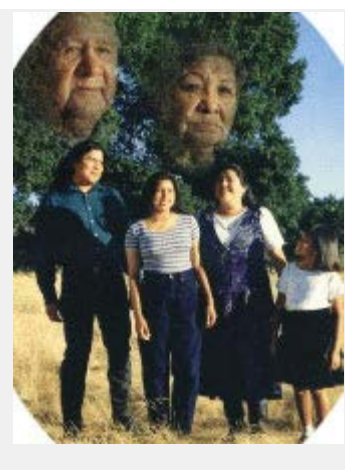
Native Family Contemporary