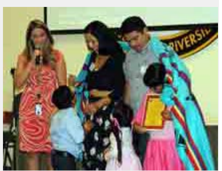
Tribal STAR Honored family