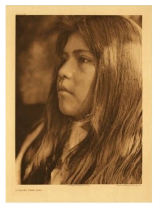
Coast Pomo Curtis Library