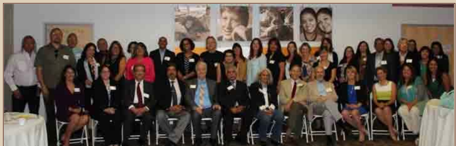
Participants at 3rd Annual Judges Dinner