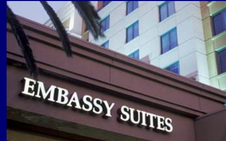
Embassy Suites - Arcadia, CA