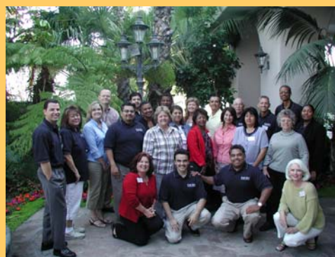
Leaders In ACTION Participants

Update from California Department of Social Services